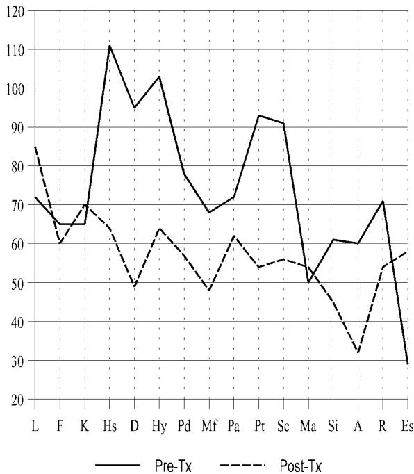
Fig. 1. MMPI Changes in an OCD case after 25 h of neurofeedback.

subscale. Once again, external validation of improvements and their maintenance was obtained by talking with his family.