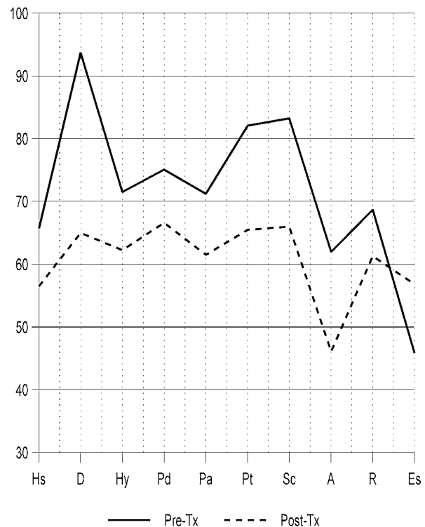
Fig. 3. Neurofeedback for depression: Average MMPI Pre-post changes for eight cases.

Pre-post changes on the MMPI may be seen in Fig. 3, with a mean decrease in the depression scale of 28.75 t -scores. One patient improved from severely depressed to normal and two progressed from being seriously depressed to normal. Three improved from severe to mild depression, and one improved from moderately depressed to mildly depressed. One case who was severely depressed only showed mild improvement. This was an individual who had lost his wife to cancer a year earlier and issues surrounding this loss seemed likely to need to be addressed, and he was referred for psychotherapy for these issues. Categorizing this last case and including the drop-out as failures, this represents 77.8% of cases who made significant improvements. The average length of follow-up for these cases was about 1 year, with a range from 2 years in two cases, to 4 months in the case of the individual who only mildly improved.