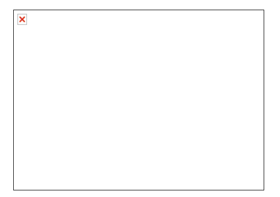
Figure 4. TOVA standard scores for experimental and control groups for pre-training, post-SMR, and post-alpha-theta assessments (+ p<.05, * p<.005).

(Psychasthenia) scale, although the difference between groups on this scale was not significant F(1, 81)=1.727, p>.05. Both groups improved on the Pd (Psychopathic Deviate) scale, F(1, 81)=29.016; F(1, 81)=12.832, p < .05, respectively.